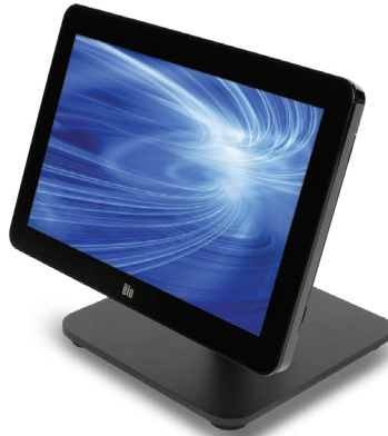
*stand sold separately